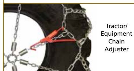
Tractor/ Equipment Chain Adjuster