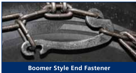
Boomer Style End Fastener