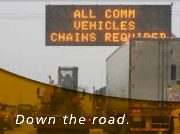
Down the road.