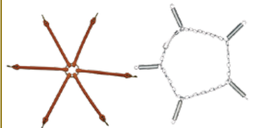
Stretch Chain Adjuster