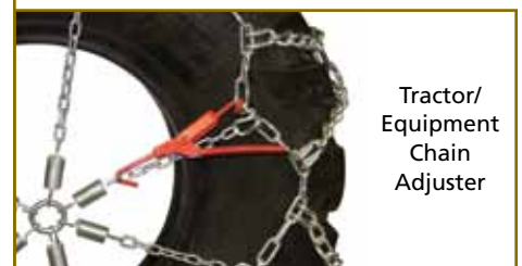
Tractor/Equipment Chain Adjuster