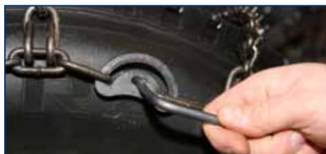
Cam Tightener Side Chain