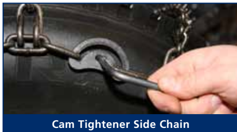
Cam Tightener Side Chain