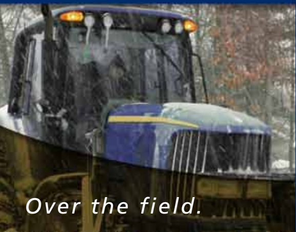
Over the field.

All Aquiline™ ladder design tire chains feature heavy duty cross chain hooks, hardened steel side chains and easy to use boomer style side chain fasteners. Custom Aquiline™ tire chains are completely assembled in our New Hampton, New Hampshire facility.