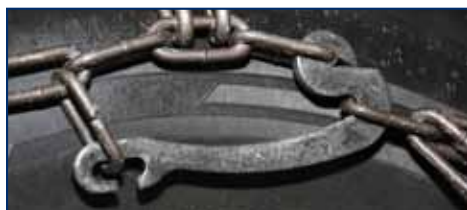
Boomer Style End Fastener