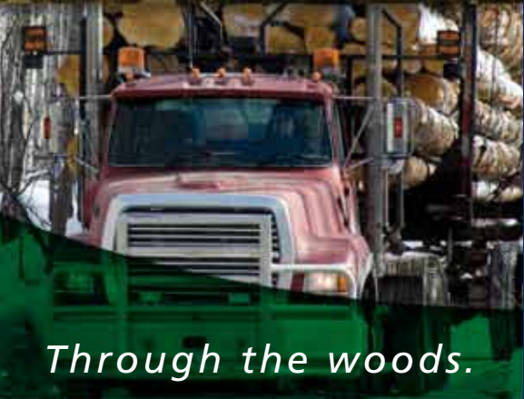
Through the woods.