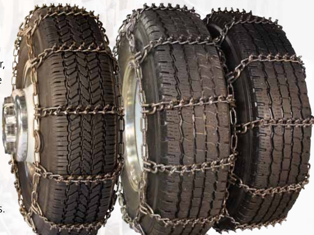
TALON TRUCK SINGLE

Aquiline® Talon Truck, Talon Tractor, Talon Grader/Loader, and MPC tire chains feature cross chains manufactured from specially designed alloy steel, which has been case hardened for added durability. Aquiline® Tire Chains provide increased traction and safety in the most demanding conditions.