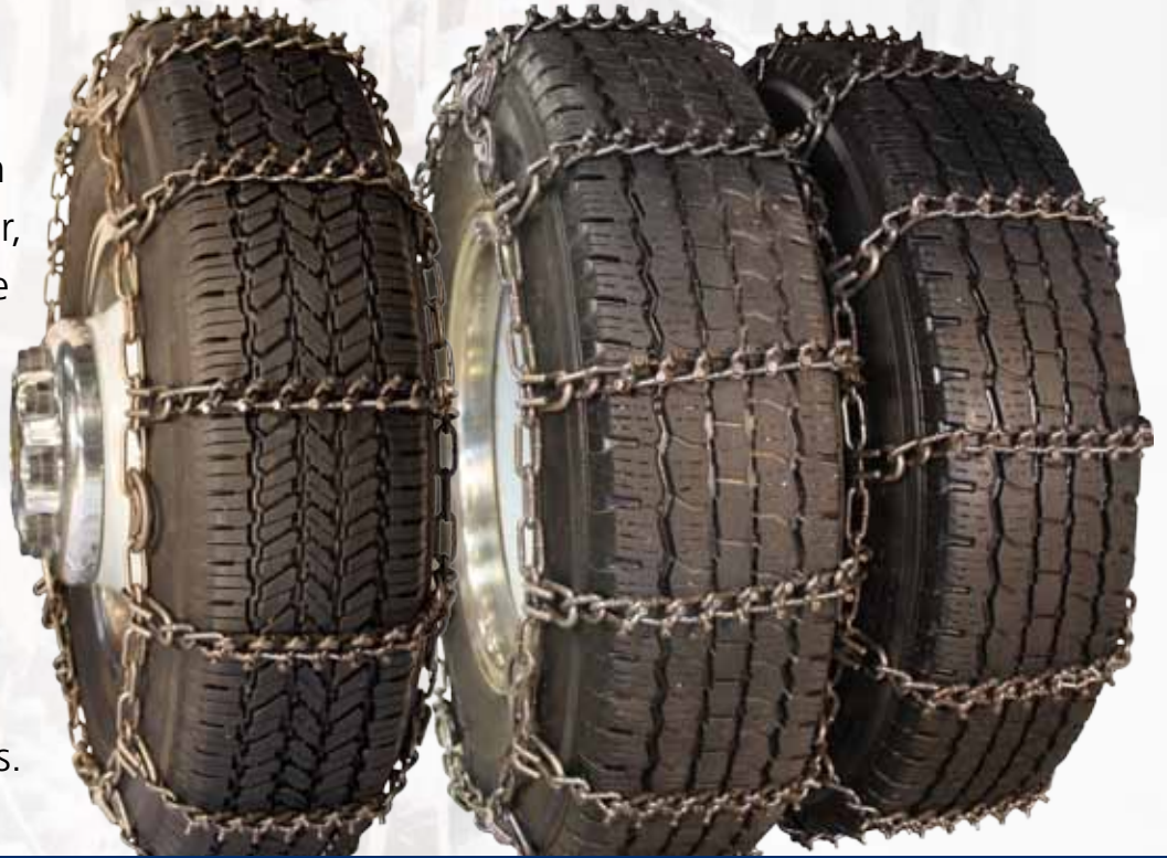
TALON TRUCK SINGLE

Aquiline® Talon Truck, Talon Tractor, Talon Grader/Loader, and MPC tire chains feature cross chains manufactured from specially designed alloy steel, which has been case hardened for added durability. Aquilene® Tire Chains provide increased traction and safety in the most demanding conditions.