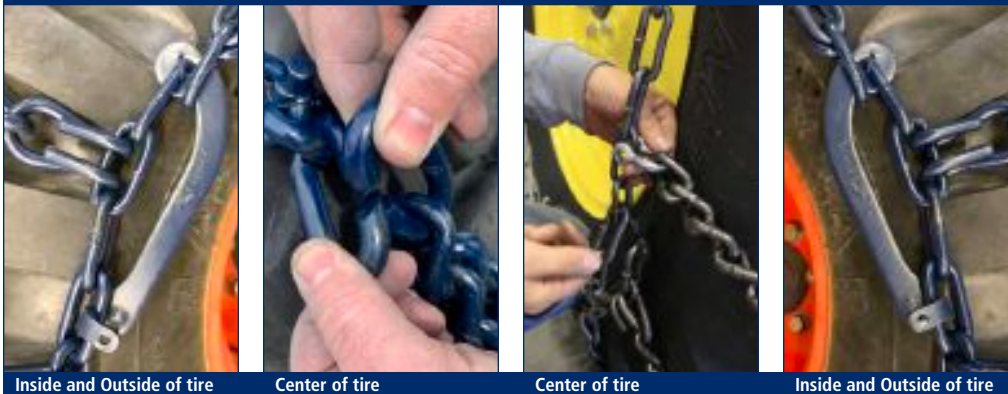
Inside and Outside of tire