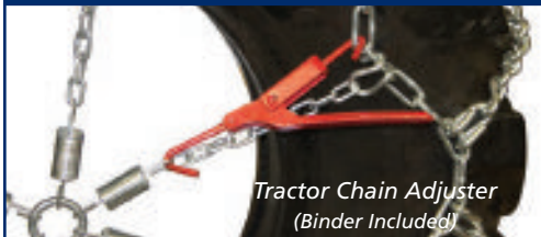
Tractor Chain Adjuster (Binder Included)

Add chain adjusters for a more secure fit and to extend the life of your chains.