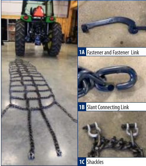
1A Fastener and Fastener Link