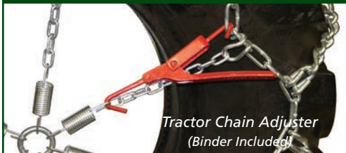
Tractor Chain Adjuster (Binder Included)

Add chain adjusters for a more secure fit and to extend the life of your chains.