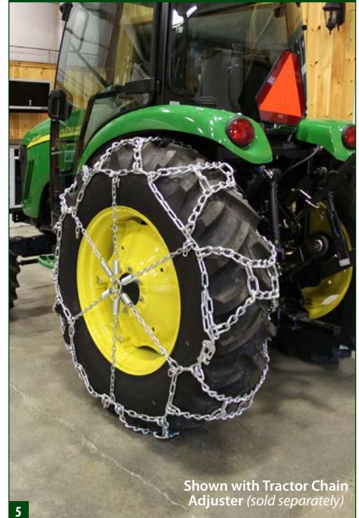
Shown with Tractor Chain Adjuster (sold separately)

Test Drive, Inspect, Re-Tighten tire chains by REPEATING STEPS 4A- 4D so chains fit snug around the tire. Make sure the fastener is secure.