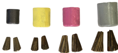
Wedge Ferrule Assemblies 1/2" to 3/4"