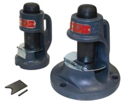
Cable Cutter and Blades