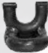
Rough Cut Stud

U-Form studs are welded on the flat (square) side of the link remaining upright for better wear and superior traction. These studs do not lay down like traditional studded chains, improving traction over rock, frozen/wet wood, ice or ledge. Standard studs are formed wire with finished ends.